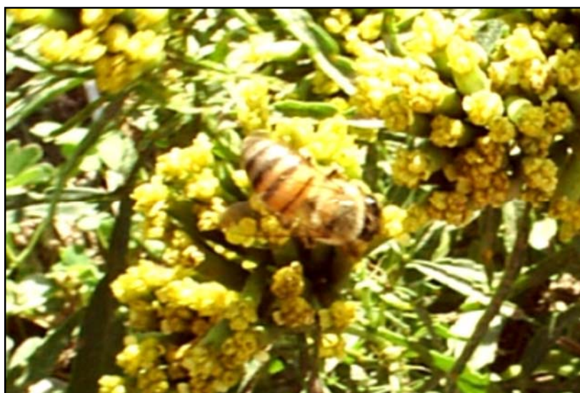
Figure 1. Bees visiting flowers of Tagetes minuta L.

Bees usually visit the flowers of this species (Figure 1). This plant is well known among beekeepers and constitutes the last source of pollen and nectar in autumn. We corroborated, by means of a melissopalynological analysis, the presence of T. minuta L. pollen in the honey of the hives used for this work.